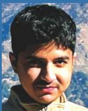
SHAKALYA 6th MA Eco Sem 1